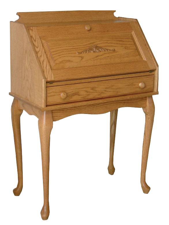
Fold Down Secretary Desk Item #S310 (Queen Anne) 31w x 16d x 43h