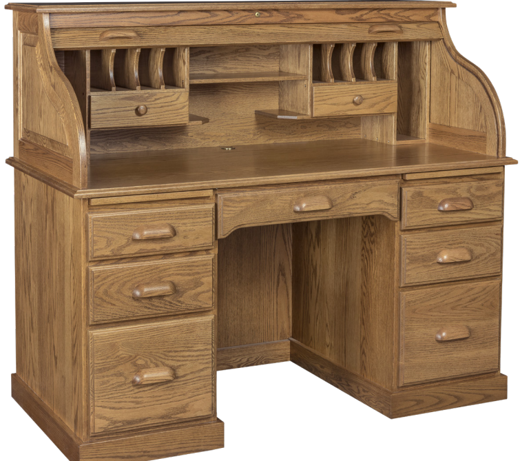
56" Rolltop Desk Item #R561