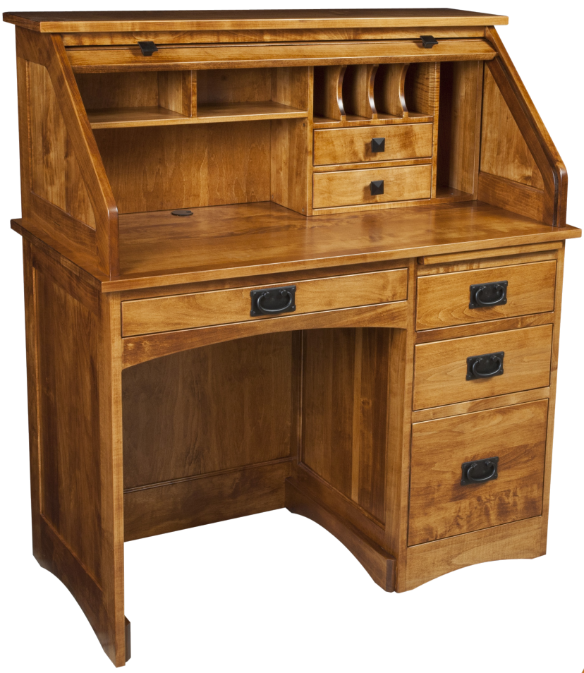
Single Pedestal Mission Rolltop Desk Item #R425M 42w x 22d x 47h